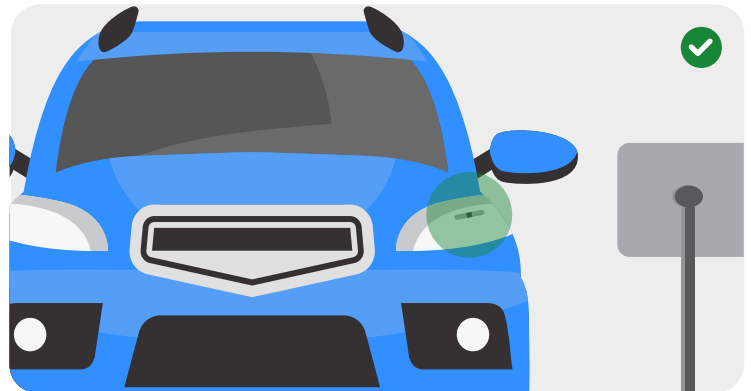
Install tags on the same side as the reader